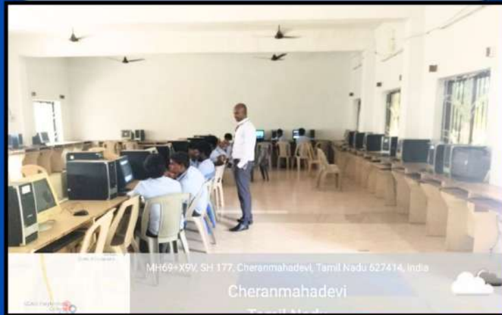
MH69+X9V, SH 177, Cheranmahadevi, Tamil Nadu 627414, India Cheranmahadevi

The purpose of skill training is to educate and upskill individuals. It helps to bridge the knowledge gap and enhance professional development. Skill training enables learners to acquire new skills and expertise.