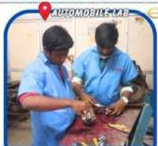
TWO WHEELER MAINTENANCE

FOUNDATION SKILLS FOR FIRST YEAR STUDENTS 08.07.2023 DAY - 07