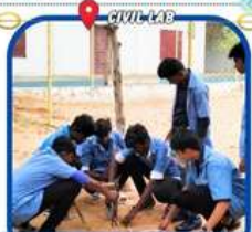
BASIC CIVIL ENGINEERING