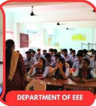
DEPARTMENT OF EEE