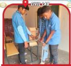
BASIC CIVIL ENGINEERING