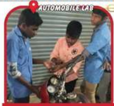
TWO WHEELER MAINTANENCE

FOUNDATION SKILLS FOR FIRST YEAR STUDENTS 12.07.2023 DAY - 09