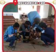
BICYCLE DISMANTLING AND ASSEMBLING