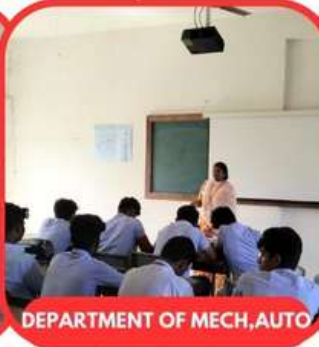
DEPARTMENT OF MECH, AUTO