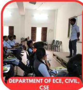
DEPARTMENT OF ECE, CIVIL, CSE

EXCLUSIVE FOR ALL FINAL YEAR STUDENTS SKILL TRAINING PROGRAM DAY 19 12.07.2023