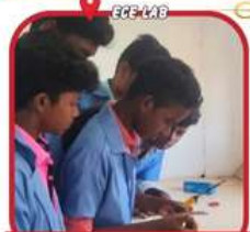
BASICS OF ELECTRONICS