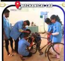
BICYCLE DISMANTLING AND ASSEMBLING