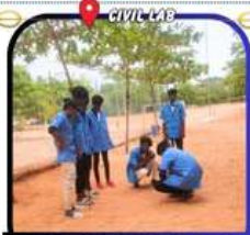
BASIC CIVIL ENGINEERING