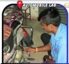
TWO WHEELER MAINTENANCE